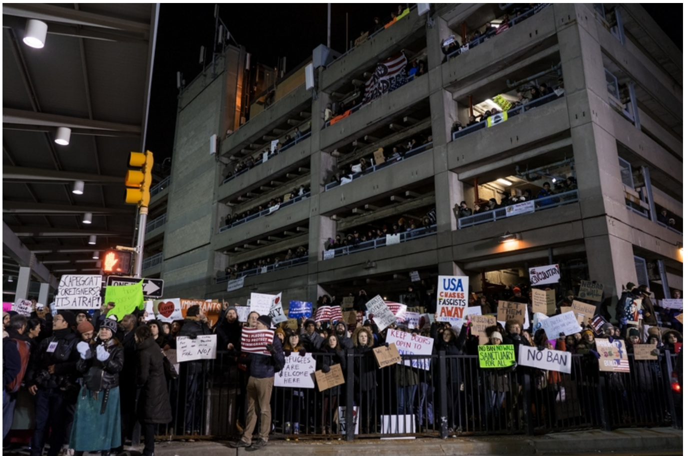
Protesters assemble at Kennedy Airport in New York on Jan. 28, the day after President Donald Trump signed an executive order suspending all immigration from seven countries for 90 days.

"But sophisticated companies and trade associations in Washington know that you can't turn on and off lobbying like a light switch. They know that you need a sustained presence on both sides of the aisle, regardless of whether the legislative market is a bull market or a bear market."