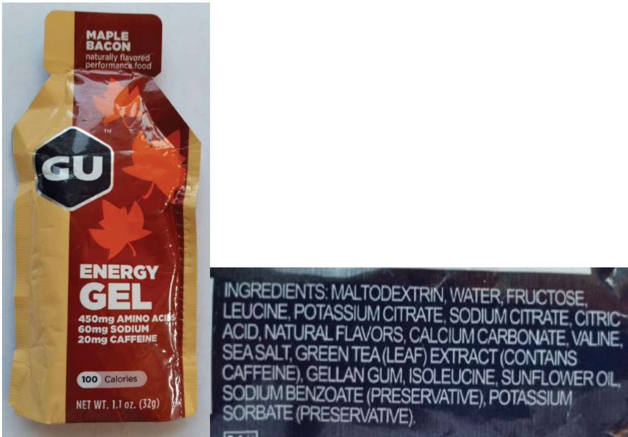
Figure 6: GU Maple Bacon Energy Gel