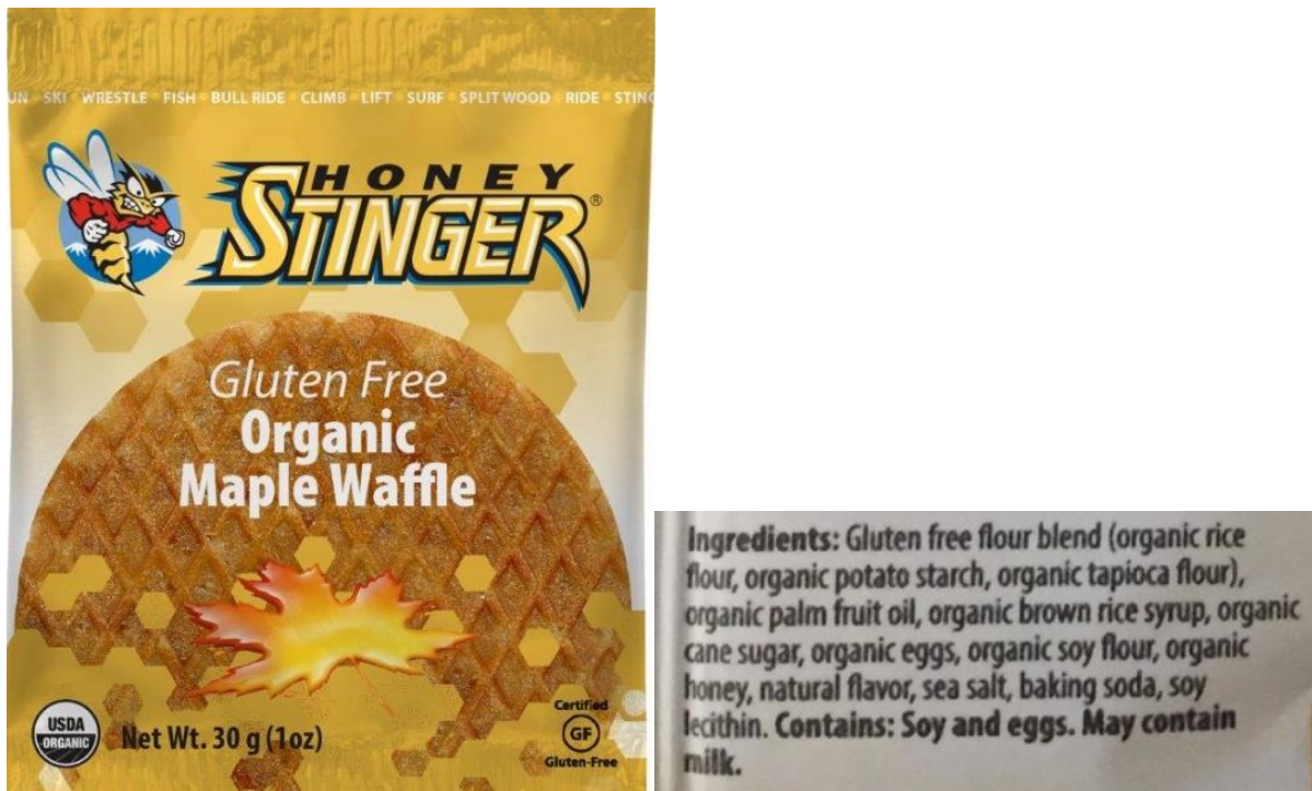
Figure 3: Honey Stinger Organic Maple Waffle