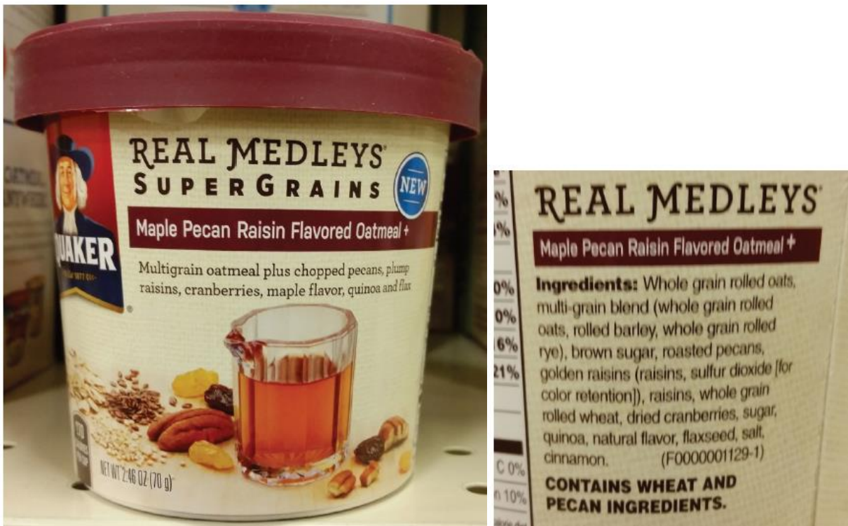
Figure 7: Quaker Oats Maple Pecan Raisin Flavored Oatmeal